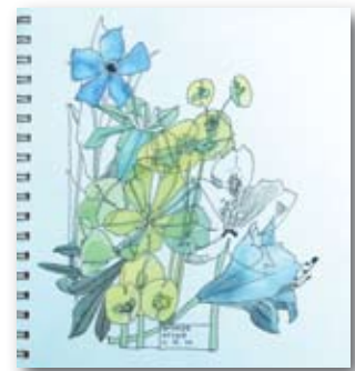
ABOVE Spurge , in the style of Charles Rennie Macintosh